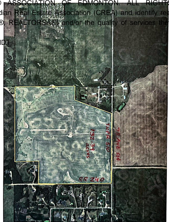
Scanned with CamScanner

Listing information last updated on April 17th, 2025 at 10:47pm MDT