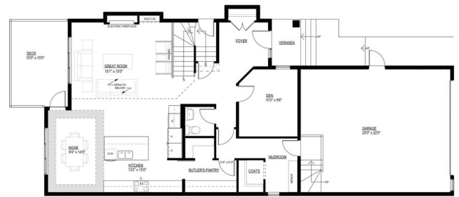
MAIN FLOOR PLAN 1219 SQ. FT.