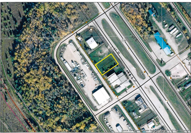
5122 & 5118 50A St

Great location along the main street in Cynthia. West Pembina Field Office is directly beside these two lots. The water and sewer are on the property line in the back alley. This is a main Hwy for traffic and Great exposure to for your business. Priced to sell!