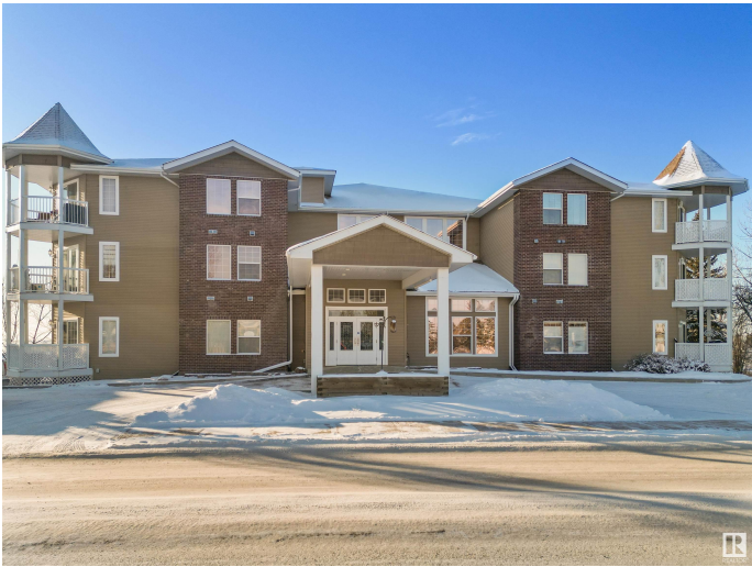
102-4128 47 St, Drayton Valley, AB